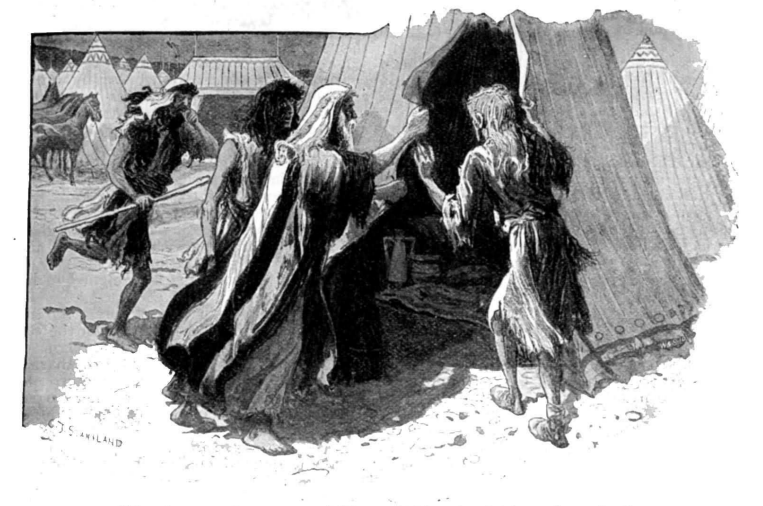
"These lepers went into one tent, and did eat and drink, and carried thence silver, and gold,

6For the LORD had made the host of the Syrians to hear a noise of chariots, and a noise of horses, even the noise of a great host: and they said one to another, Lo, the king of Israel hath hired against us the kings of the Hittites, and the kings of the Egyptians, to come upon us.